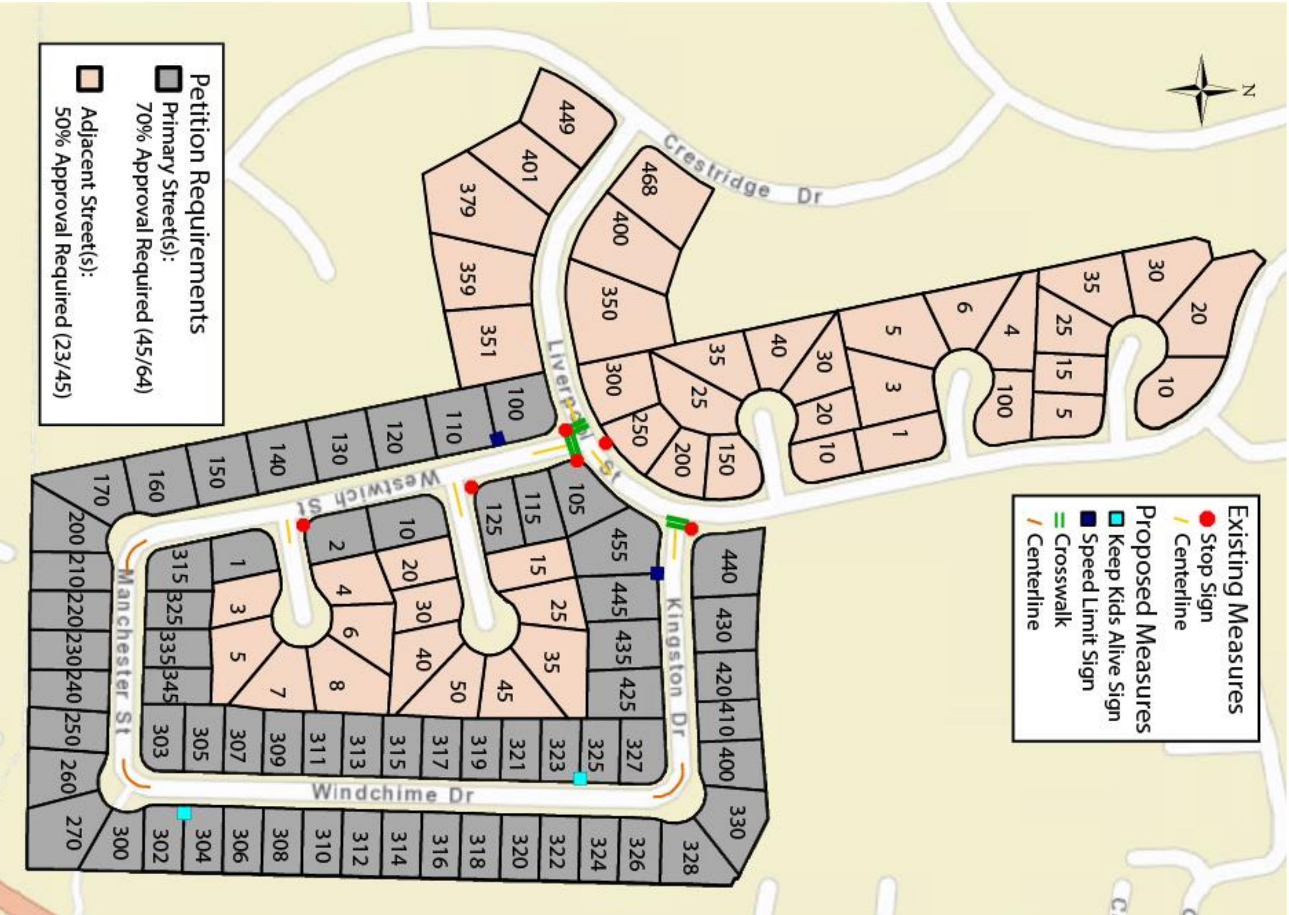
Proposed Traffic Calming Plan